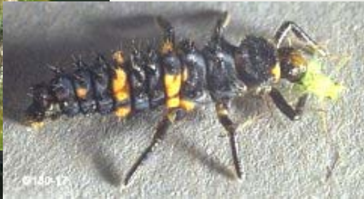
Plant pathology group