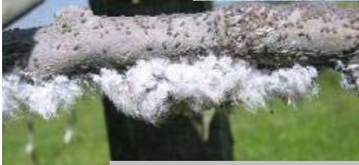
Plant entomology group