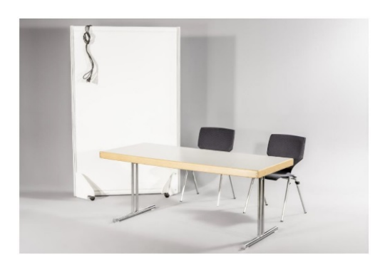
Mini booth 4 m<sup>2</sup> (2 m wide x 2 m deep)