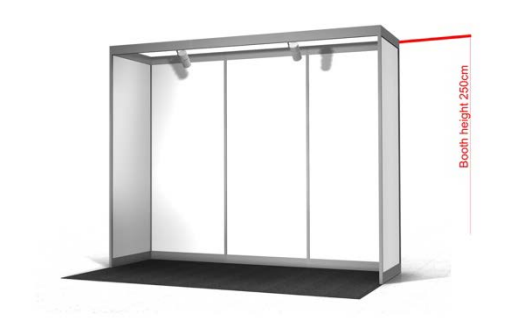
6 m<sup>2</sup> (3 m wide x 2 m deep)

The below images are for illustration purposes only. A partial shell scheme will be provided for all exhibition booths with full walls to the rear.