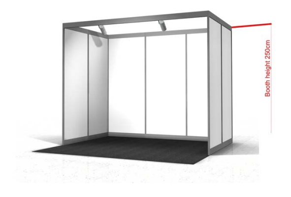
9 m<sup>2</sup> (3 m wide x 3 m deep)