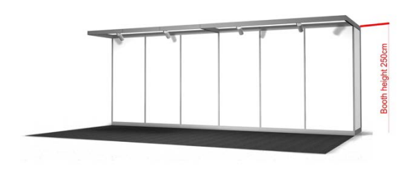
18 m<sup>2</sup> (6 m wide x 3 m deep)