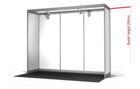
6 m^2 (3 m wide x 2 m deep)

The below images are for illustration purposes only. A partial shell scheme will be provided for all exhibition booths with full walls to the rear.