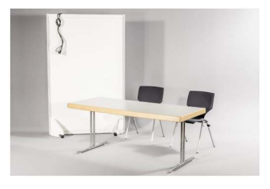
Mini booth 4 m<sup>2</sup> (2 m wide x 2 m deep)