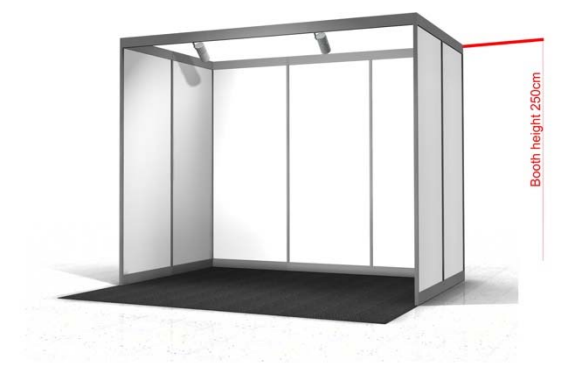
9 \text{ m}^2 (3 m wide x 3 m deep)